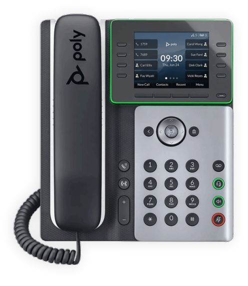
Poly Edge E320