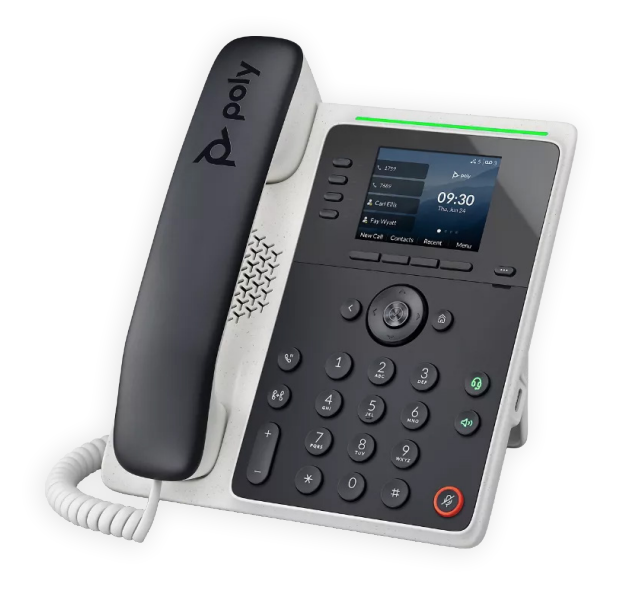
Poly Edge E220