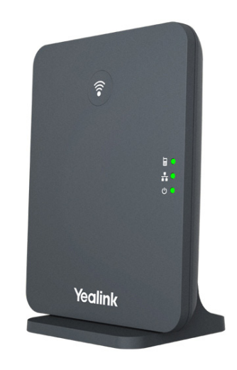
Yealink DECT IP Base Station W70B