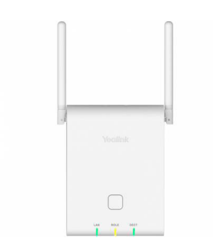
DECT IP Multi-Cell Base Station W90B