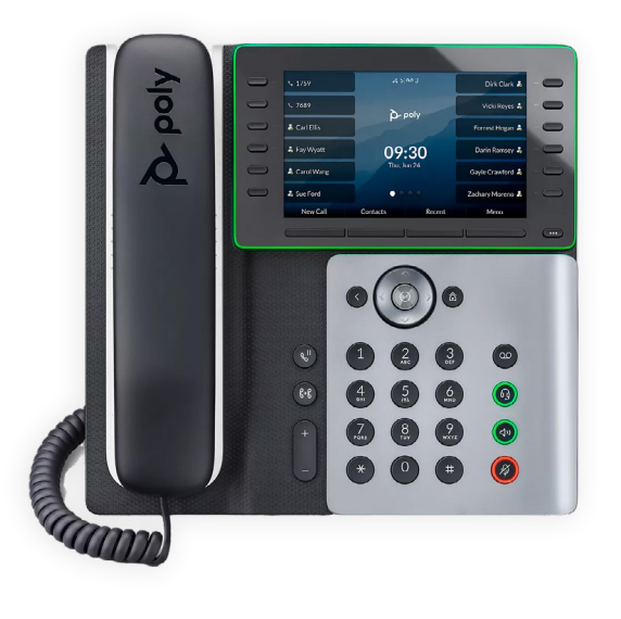
Poly Edge E500