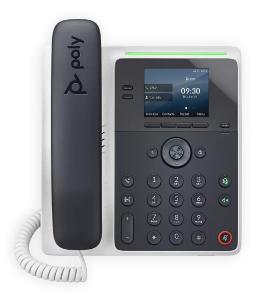
Poly Edge E100