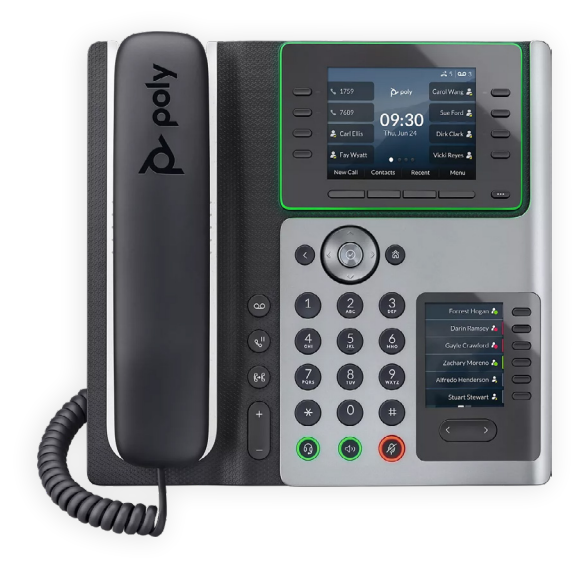
Poly Edge E400