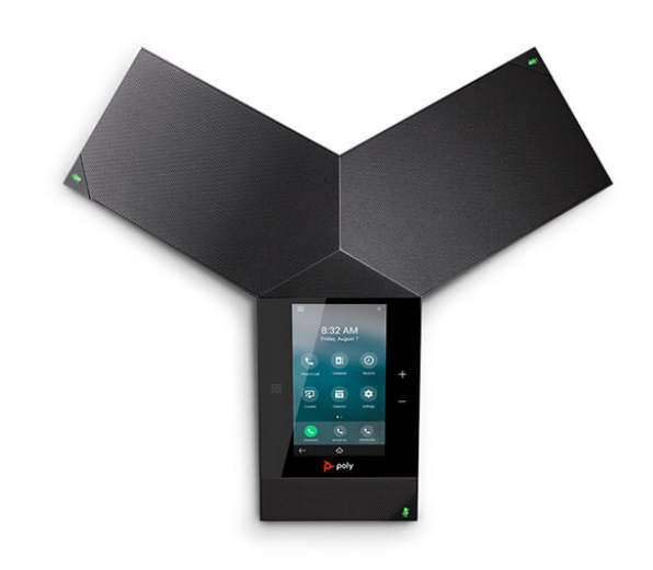
Poly Trio 8300 Conference Phone